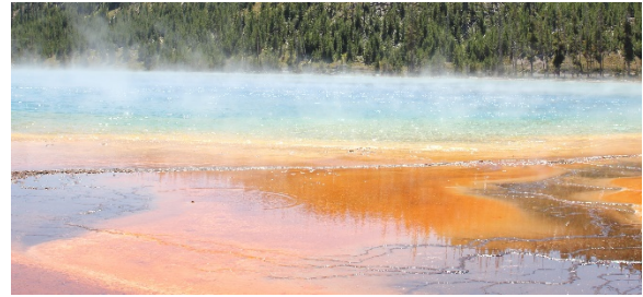
Grand Prismatic Spring

Yellowstone is famous for geysers - hot springs that have water that intermittently boils, and sends a tall column of water and steam into the air. “Old Faithful” got its name because it is faithful to shoot water every 44 – 125 minutes. It can shoot water as high as 180 feet in the air. The second photo is a rainbow. After a heavy downpour, we thought we’d head out and look for animals seeking food. We were rewarded with pronghorn antelope and a rainbow. The final photo shows a hot spring. Check out all the colors. The multicolored layers get their hues from different species of thermophile (heat-loving) bacteria living in the progressively cooler water around the spring. Isn’t it amazing that God can bring beauty – even from bacteria?! It is my hope these photos will help remind you that God is faithful, He always keeps his promises, and His creation (including YOU) is beautiful . This is a very difficult time around the world. Much about our lives has changed. But God has not changed. Cling to Him during this time.