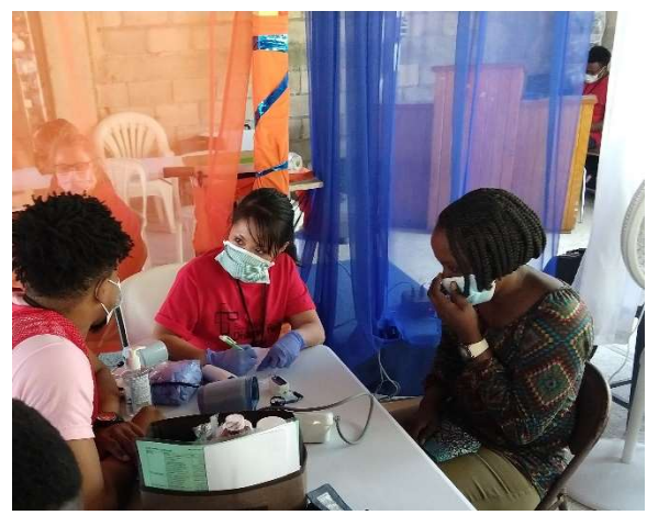
Information was gathered from each patient with the assistance of a translator