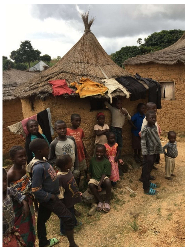
Hey kids, how many things can you see in the photo above that are different from your experience in the United States?

The kids you see are your brothers and sisters in Christ!