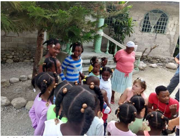
Children gather around