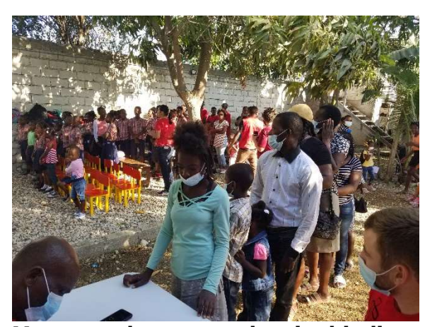
Many people came and waited in lines to be seen by medical volunteers