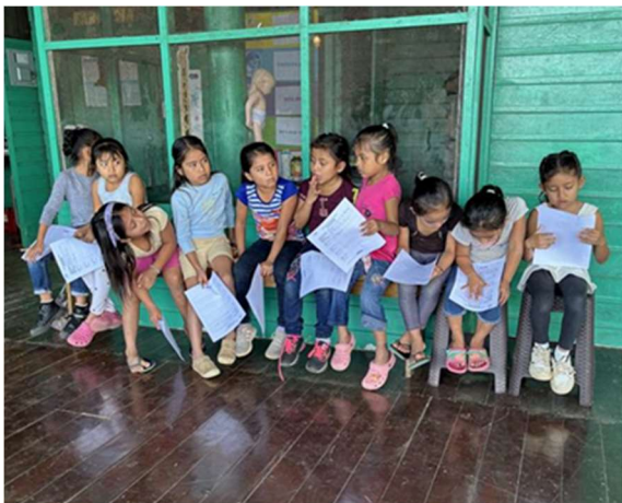
Kids lined up for their physical exams