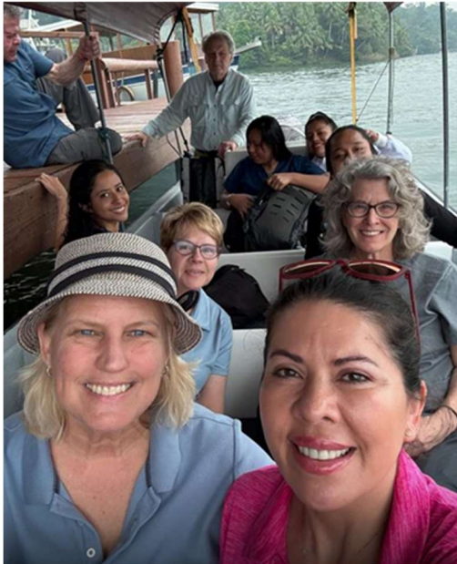
Team in a launch heading to the village

And hey – let's continue to talk about Guatemala. The goal of True North Missions is to improve community health in Mayan Indian Villages in Guatemala. You may recall from past newsletters that this ministry utilizes boats to reach the communities they serve. They had two trips in February and March – during which they did primary health exams on over 900 children and their families . Here are some photos: